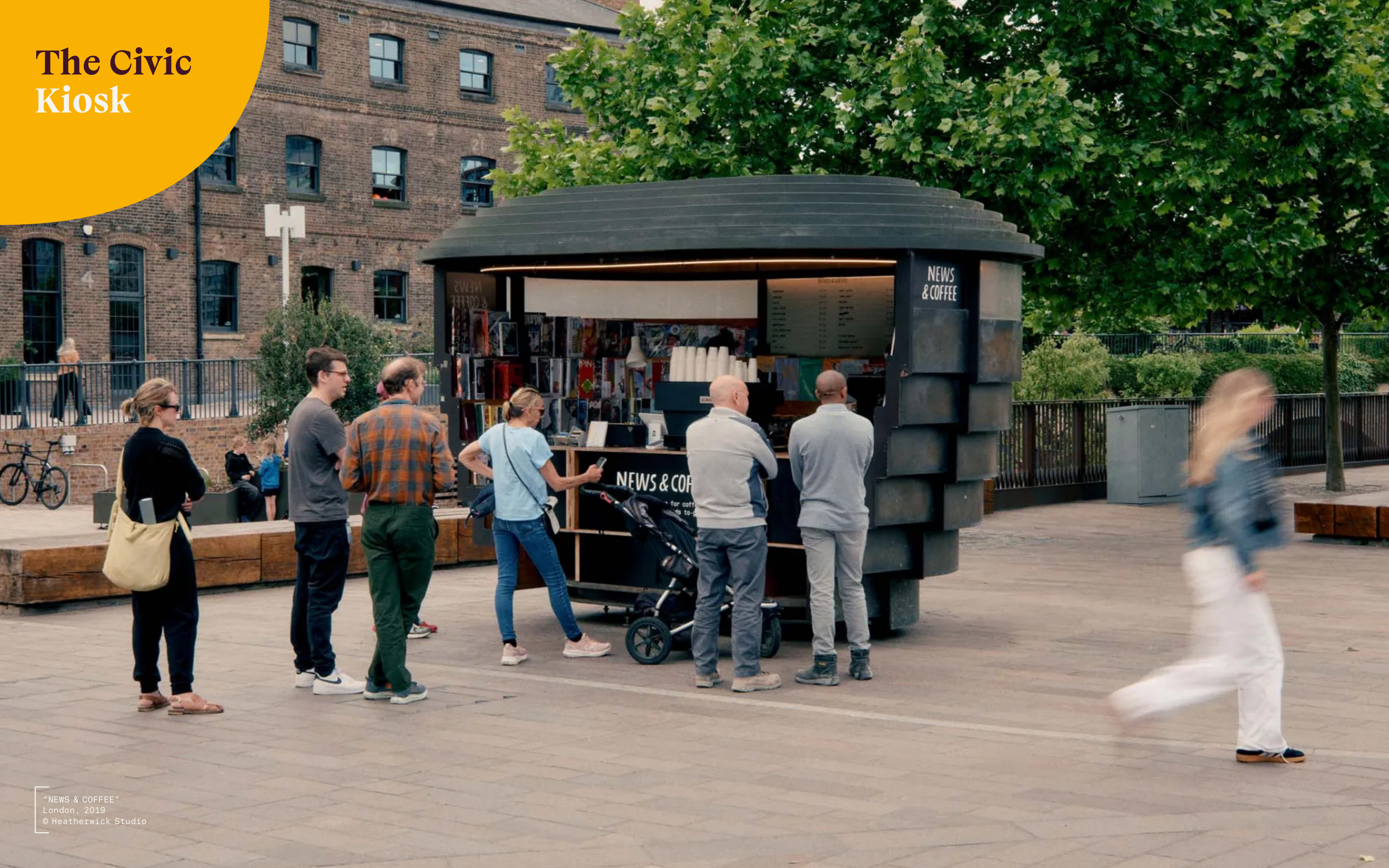
"NEWS & COFFEE" London, 2019 © Heatherwick Studio