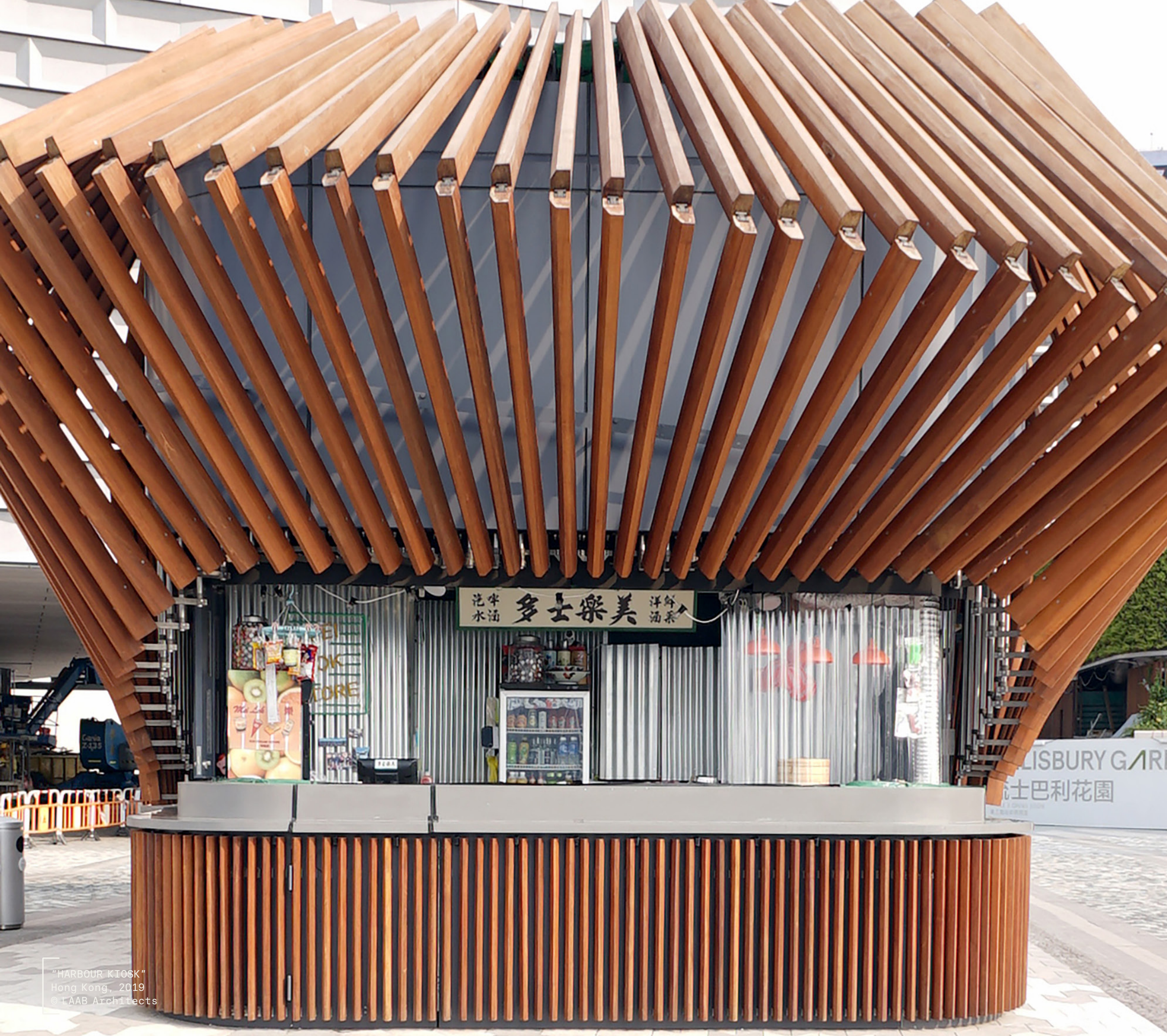
"HARBOUR KIOSK" Hong Kong, 2019 © LAAB Architects