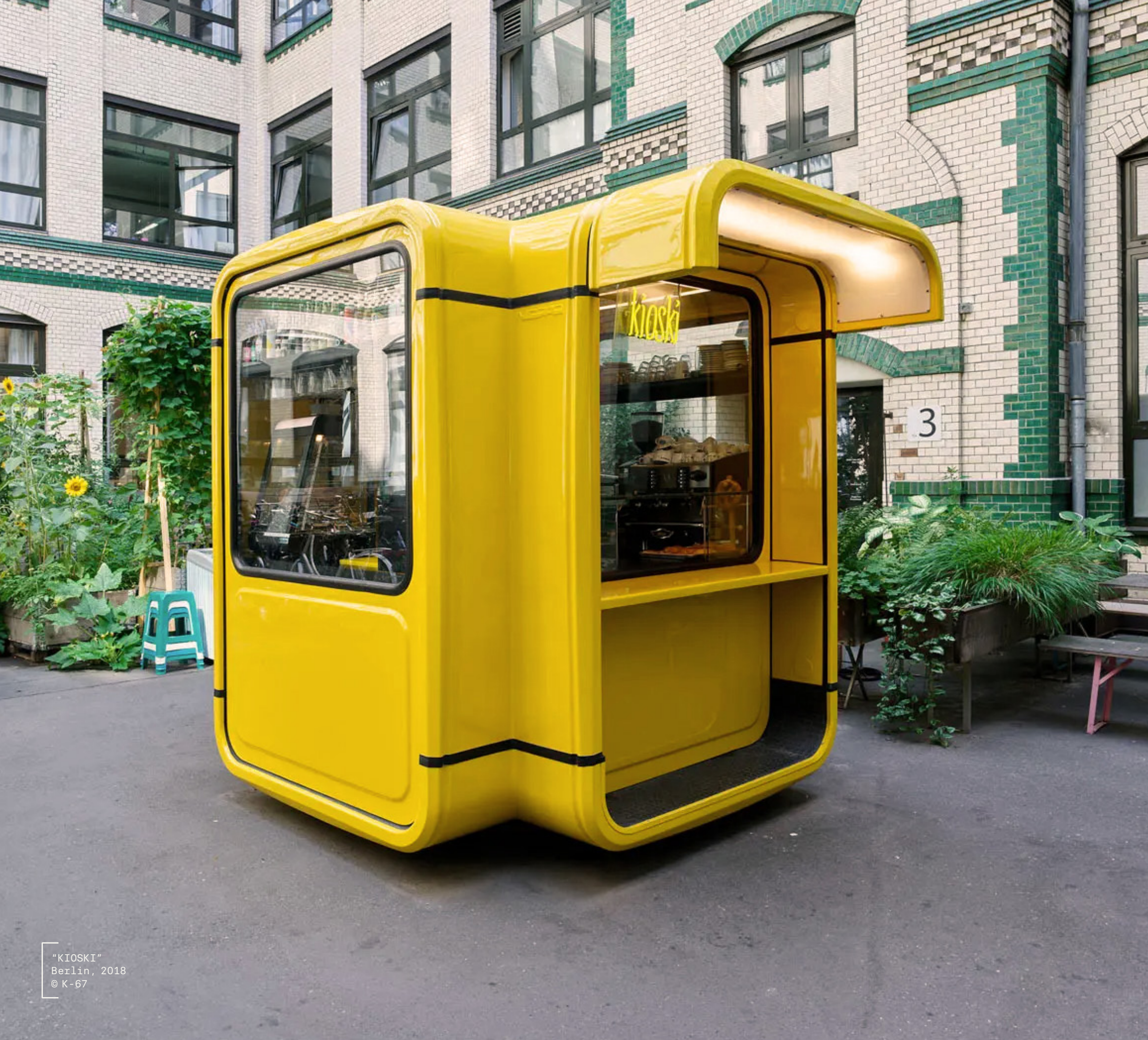
"KIOSKI" Berlin, 2018