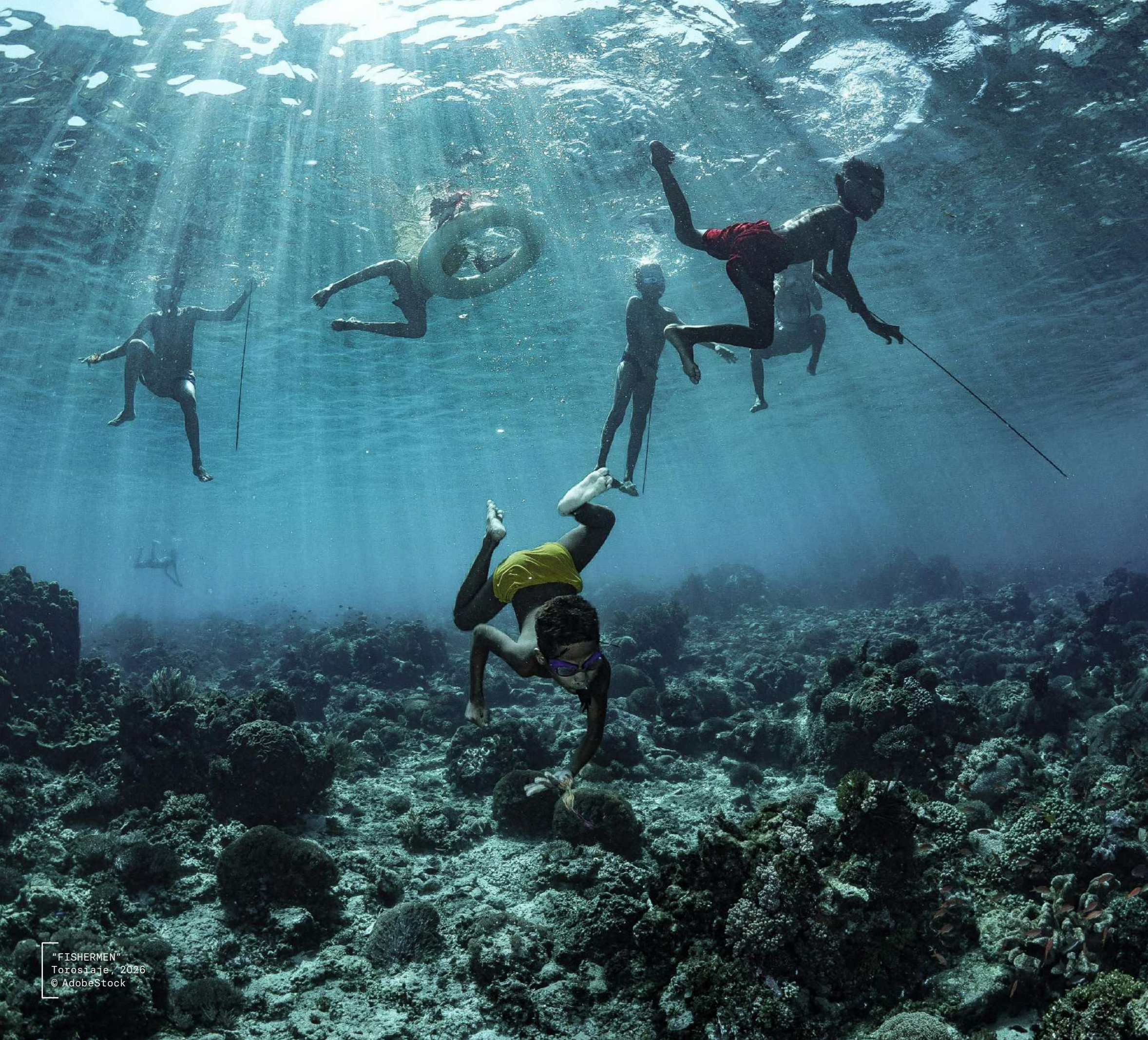
"FISHERMEN" Torosiaje, 2026